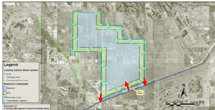
Figure 1-3 Conceptual Layout of the C-44 Water Management Project